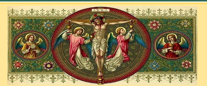
July: Month of the Precious Blood of Jesus

O God, who by the Precious Blood of your Only Begotten Son have redeemed the whole world, preserve in us the work of your mercy, so that, ever honoring the mystery of our salvation, we may merit to obtain its fruits. Amen