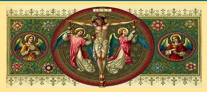
July: Month of the Precious Blood of Jesus

O God, who by the Precious Blood of your Only Begotten Son have redeemed the whole world, preserve in us the work of your mercy, so that, ever honoring the mystery of our salvation, we may merit to obtain its fruits. Amen