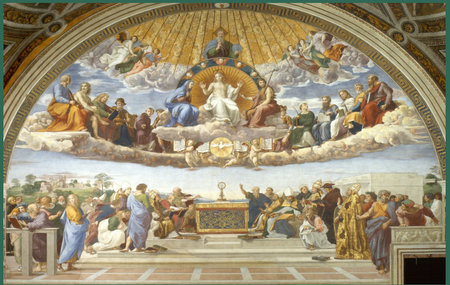
"Disputation of the Holy Sacrament," by Raphael between 1509 and 1510.