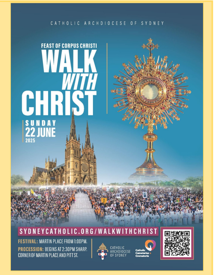
Feast of Corpus Christ Walk with Christ

Gather together for Sydney's annual Procession of the Blessed Sacrament on the Solemnity of Christ the King.