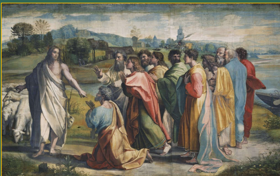
Christ's Charge to Peter, by Raphael circa 1515