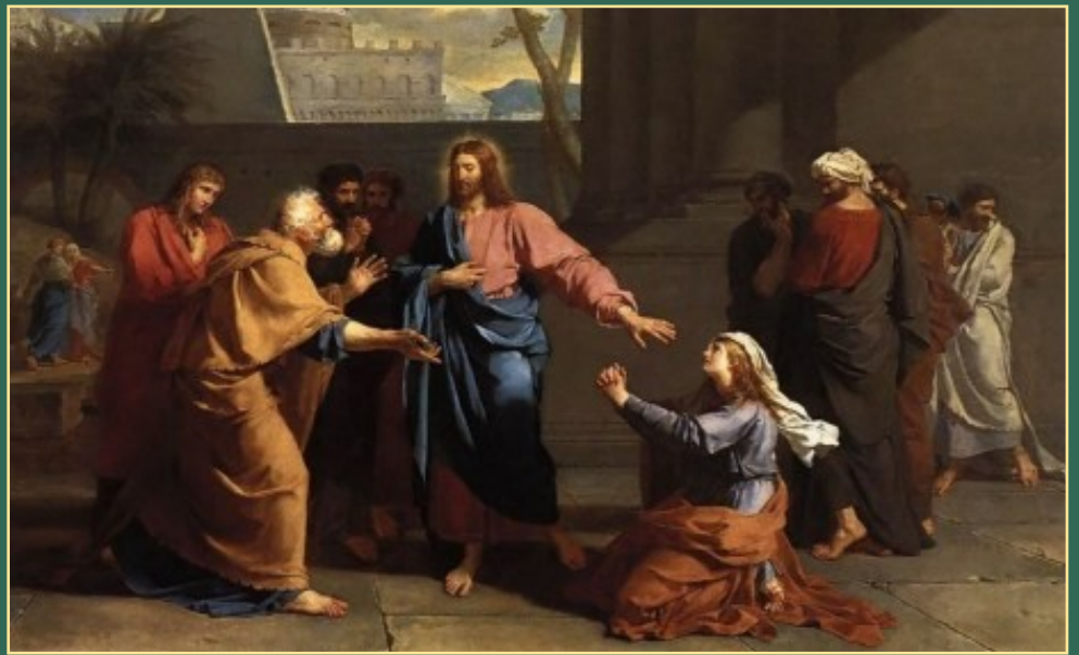
Woman Caught in Adultery