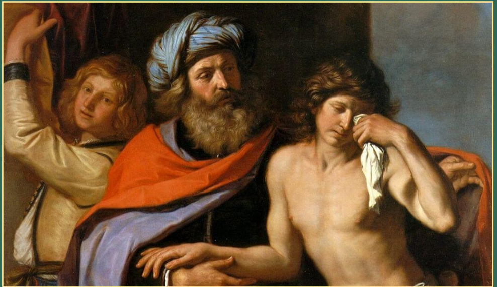
The Return of the Prodigal Son, Guercino (1619)