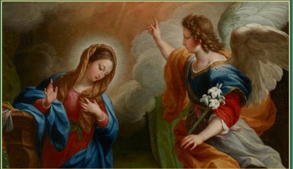
The Annunciation, Agostino Masucci (1742)