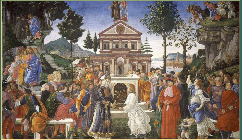
The Three Temptations of Christ, Sandro Botticelli (1480-1482)