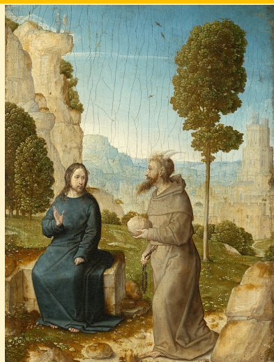
"The Temptation of Christ" by Juan de Flandes (c. 1500)

Through meticulous attention to detail and powerful portrayal of emotions, the painting invites the viewer into a profound contemplation of the spiritual struggle faced by Christ.