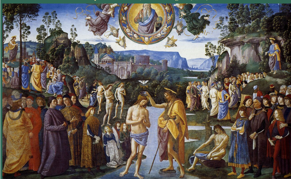
Baptism of Christ, Pietro Purgino (1482)