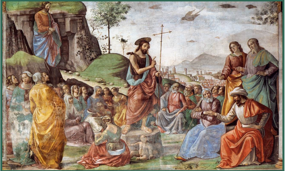
Preaching of St John the Baptist, Domenico Ghirlandaio 1486-90