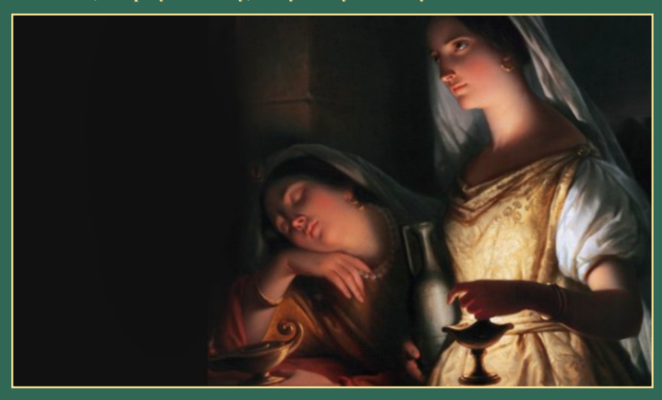
The wise and foolish virgin (painting by Jan Adam Kruseman 1848)

Be watchful, and pray constantly, that you may be worthy to stand before the Son of Man.