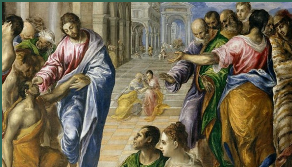
Christ healing the blind man (c 1570) by El Greco

Sunday: St Anne's - 8.00am & 5.00pm St Patrick's - 10.00am