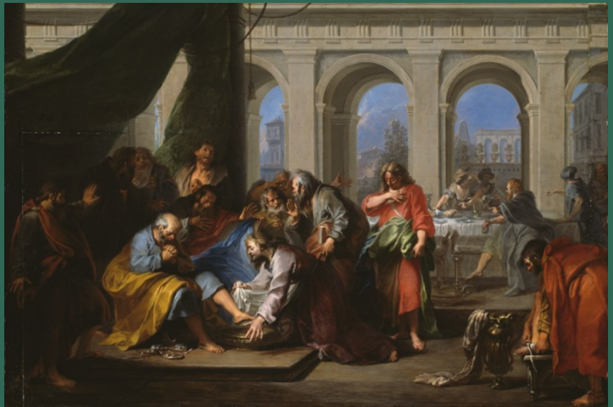
Christ Washing the Feet of His Disciples, Nicolas Bertin (French, 1668–1736)

Sunday: St Anne's - 8.00am & 5.00pm St Patrick's - 10.00am