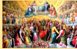
All the Saints pray for us!