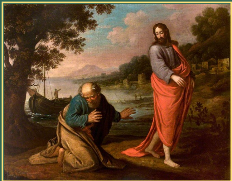
Christ rebuking Peter (Flemish School, circa 1600)

Sunday: St Anne's - 8.00am & 5.00pm St Patrick's - 10.00am