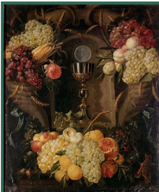
Allegory of the Eucharist

Sunday: St Anne's - 8.00am & 5.00pm St Patrick's - 10.00am