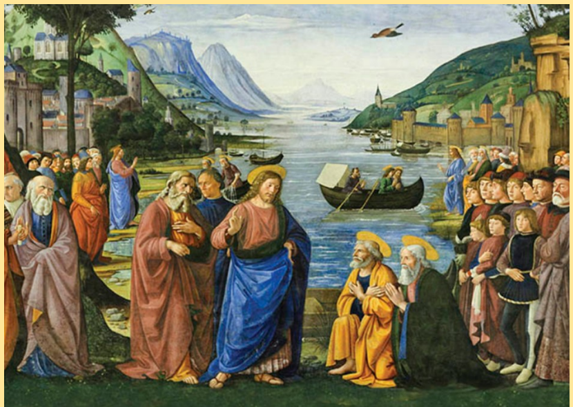
"The Calling of the Apostles", by Domenico Ghirlandaio - Sistine Chapel

* Please see notice on Page 3 regarding the date St Patrick's Church will re-open.