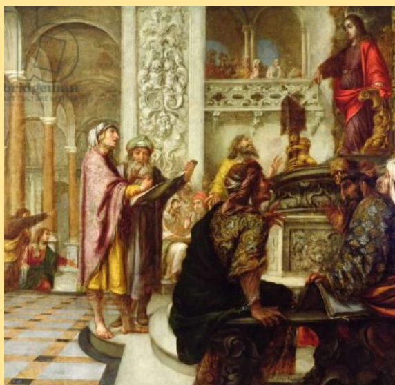
Christ Teaching in the Temple by Juan De Valdes Leal (1686)

* Please see notice on Page 3 regarding the dates St Patrick's Church is closed for renovations. All services will be held at St Anne's during this period.