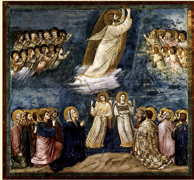
THE ASCENSION by Giotto (1305-06)

Sunday: St Anne's - 8.00am & 5.00pm St Patrick's - 10.00am