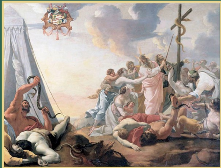
"The Bronze Serpent", Aubin Vouet (1595–1641)